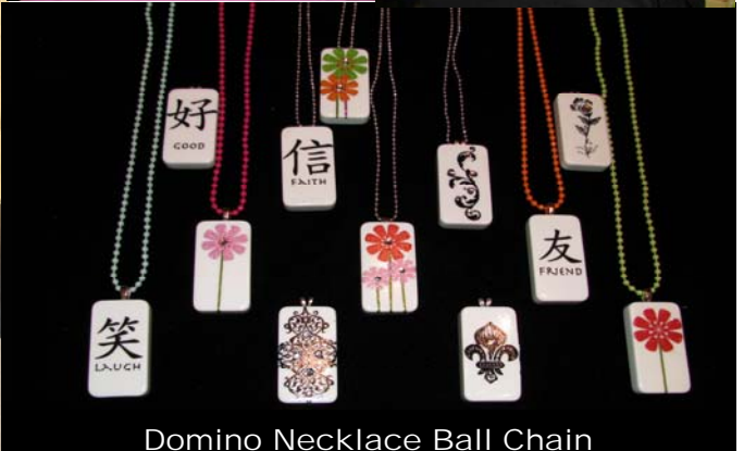
Domino Necklace Ball Chain