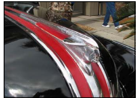
the 'Chieftain' on the '48 Pontiac Silverstreak